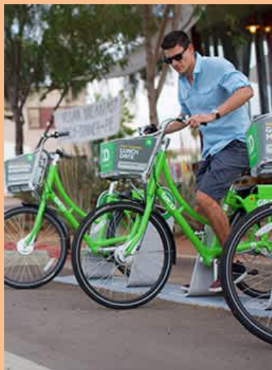
Grid Bike Tour

Rent a Grid Bike and take a two-wheeled tour of Central Phoenix's arts and culture scene.