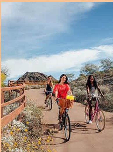
PHX by Bike

What's your bike type? Pick a ride that suits your spirit and explore Phoenix on two wheels.