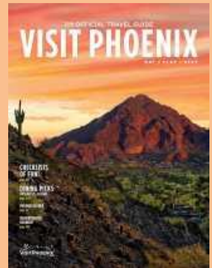
Request a Travel Guide

Order a FREE guide to help you plan lodging, dining, and things to do on your next trip to Phoenix.