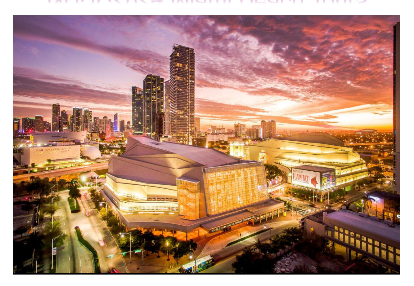
<u>Tour 9</u> – Adrienne Arsht Center for the Performing Arts